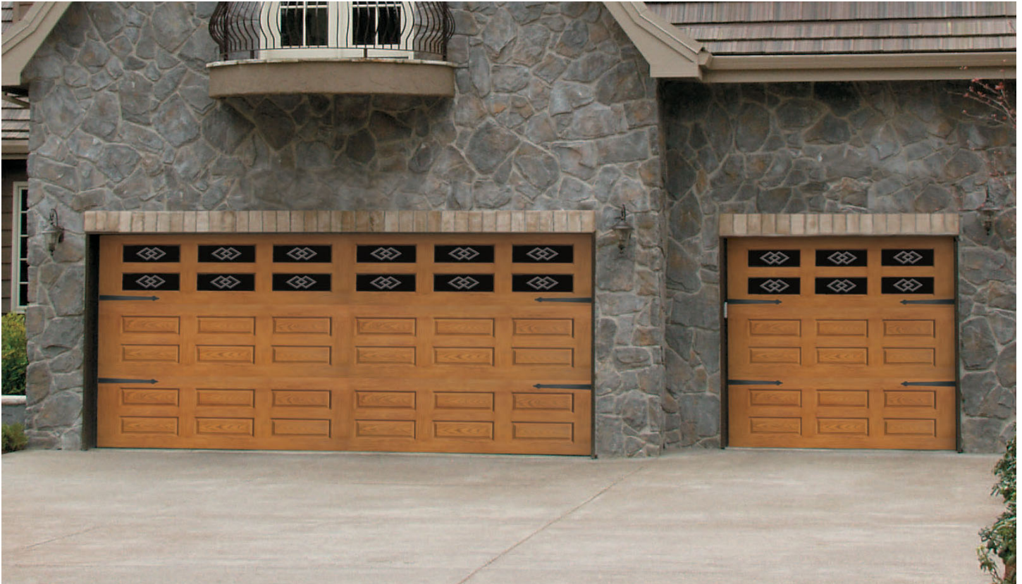
Model 9800 shown in horizontal design with Radiance Double Diamond Lites and optional decorative hardware