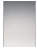
Plain Opaque Glass