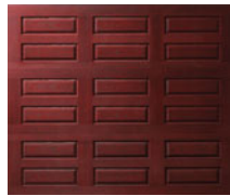
6.5' and 7' high horizontal style