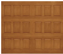
6.5' and 7' high vertical style